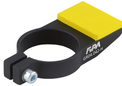
GR04.042-SE-HNBR and GR04.042-H with HNBR pad