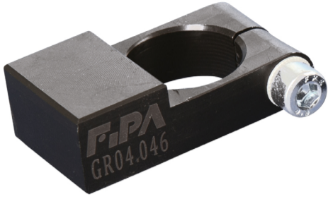
GR04.046 and GR04.042